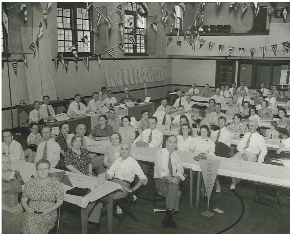
View of the "gymnasium" in 1941, with wire 'shutters' to protect windows...balcony & projection room

Originally published in the Tidings 3-23-09