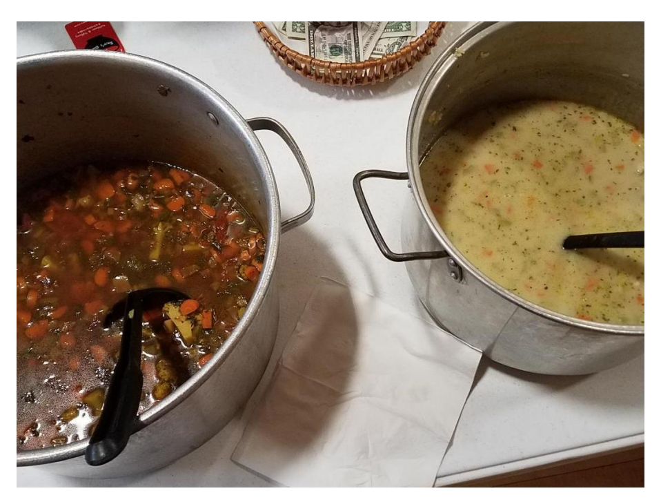
Our Sunday School students will prepare and serve soup in Webster Hall on "Souper Bowl" Sunday, February 11.