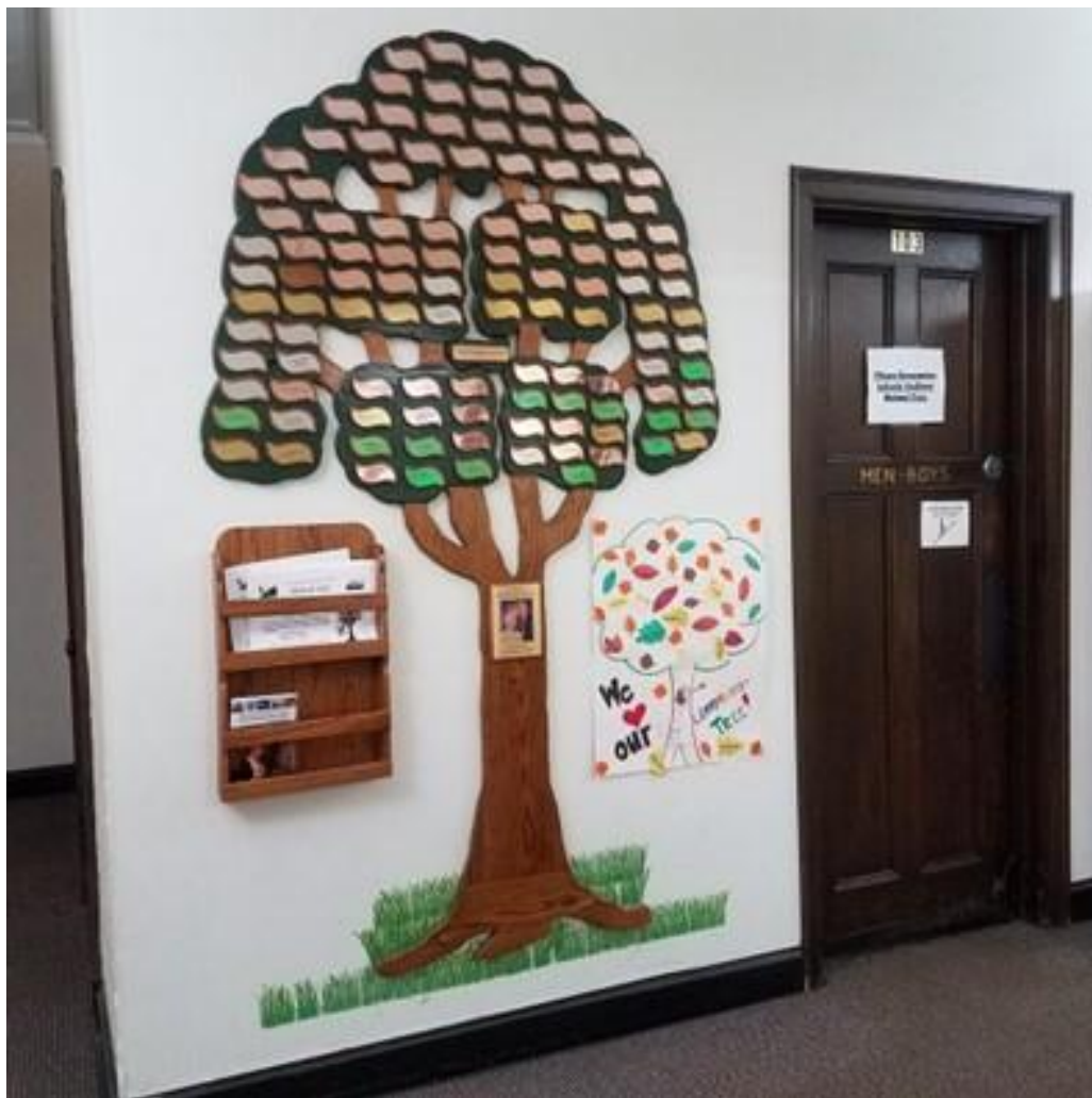
Our Tree of Life, in the main hallway.