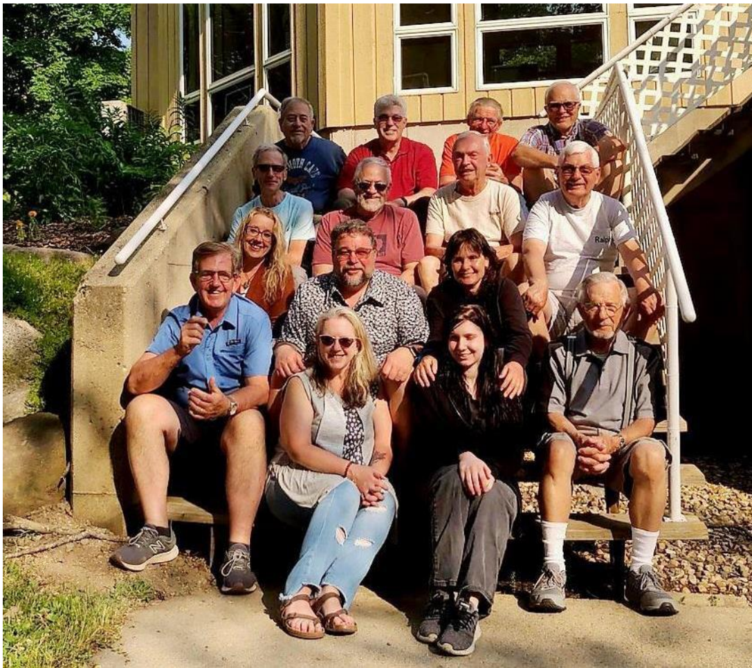
Our Summer Mission Team at Pilgrim Park.