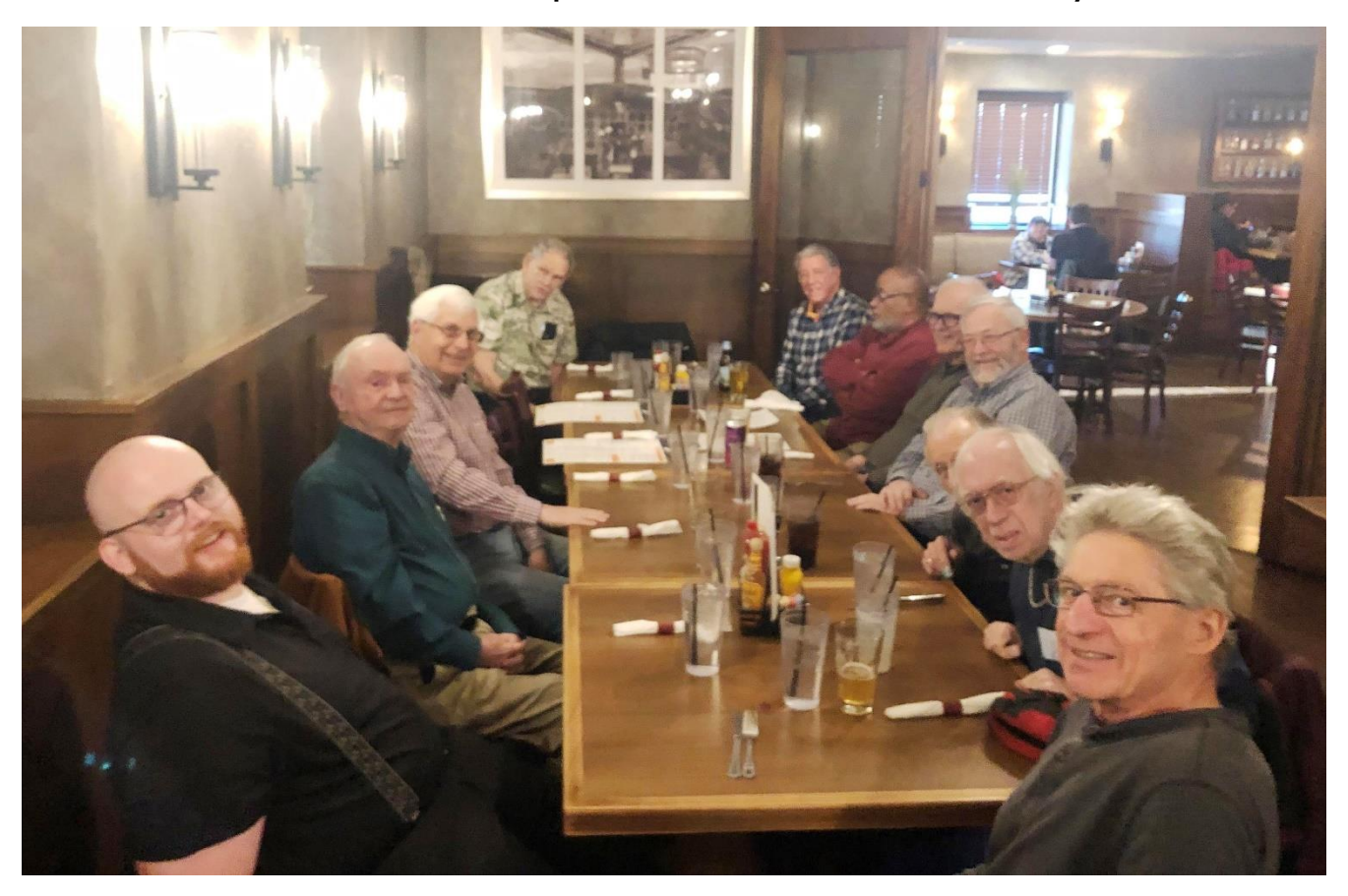
An enjoyable "Men's Night Out" was held in March, at North Branch in Glenview.