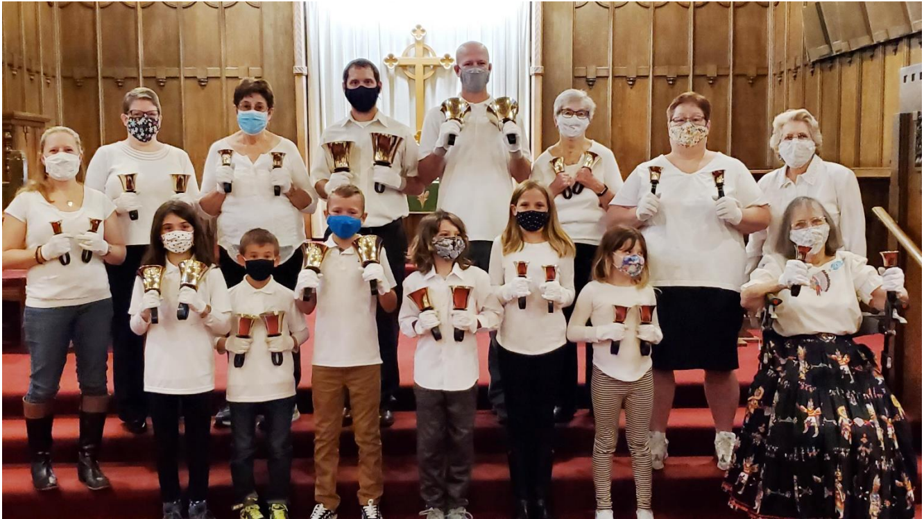
Our Wholly Ringers Intergenerational Handbell Choir