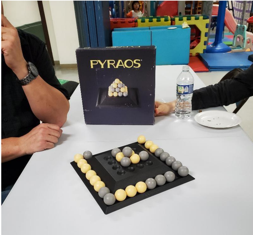
FCC Game Night in Brehm Hall