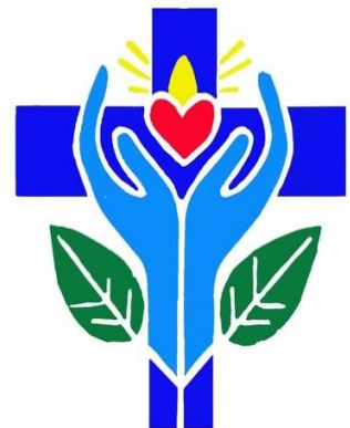
Living Our Faith Through Service