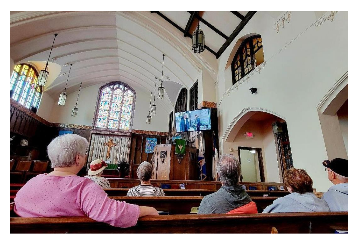
Our first "Movie Day" was held in September and featured A Man Called Otto . Participants enjoyed popcorn and other snacks in Webster Hall during intermission.